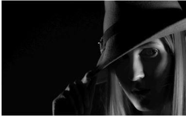
THE ENEMY IS A WOMAN 9X15ISH . PHOTOGRAPHIC PRINT, MARCH 2022

EVERYONE IS CAPABLE OF EVIL, IT'S JUST OUR ABILITIES TO NOT ACT ON IT THAT SETS US APART: "MAKE NO MOVEMENT WHICH IS CONTRARY TO PROPRIETY" (ANALECTS OF CONFUCIUS). THE FEMME FATALE ARCHETYPE IS USED IN "THE ENEMY IS A WOMAN" TO REMIND VIEWERS NOT TO UNDERESTIMATE ANYONE. THE WORLD IS FULL OF SHADOWS AND SOMETIMES WE FORGET HOW EASY IT IS TO GET LOST IN THE DARK WHILE BEING COMFORTED WITH A SMILE.