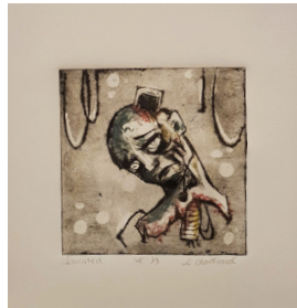
ISOLATED 4" x 4", COPPER ETCHING (PRINTMAKING) JANUARY, 2018

THEY BOTH DISPLAY HUMAN FLAWS. ISOLATED SHOWS HOW PEOPLE CAN BECOME OBSESSED WITH SOCIAL MEDIA AND THE DIGITAL WORLD AND BECOME ISOLATED FROM IN-PERSON RELATIONSHIPS, AND I'M NOT THAT SCARY SHOWS HOW QUICK PEOPLE CAN BE TO JUDGE OTHERS.