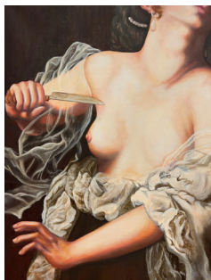
FABRIC STUDY 01 (AFTER GENTILESCHI) 18"x24", OIL ON CANVAS, 2020-PRESENT