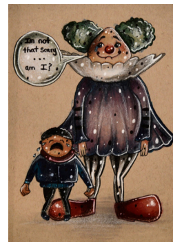
AM I SCARY, 4" x 6", COPIC MARKERS, PENCIL CRAYON JUNE, 2019

PLEASE VISIT THE VIRTUAL EXHIBIT BY SCANNING THE QR CODE BELOW