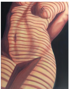
LIGHTING STUDY 01, 18"x24", OIL ON CANVAS, 2020.

MY ARTWORKS REFLECT ON ISSUES OF OBJECTIFICATION, AUTHORSHIP, AND CRIME IN ART THROUGH THE USE OF THE FEMALE NUDE AND THE COPY. IN PAINTING 'LIGHTING STUDY 01', I QUESTION WHETHER IT'S POSSIBLE TO PAINT A NUDE BODY WITHOUT INHERENTLY OBJECTIFYING THE SUBJECT, EVEN IF IT IS NOT THE ORIGINAL INTENT. 'FABRIC STUDY (AFTER GENTILESCHI)' IS A COPY OF PART OF ARTEMISIA GENTILESCHI'S 'LUCRETIA' (1627). GENTILESCHI'S ORIGINAL PAINTING RUMINATES ON THE STORY OF LUCRETIA, A NOBLEWOMAN FROM ANCIENT ROME WHO TOOK HER OWN LIFE IN THE AFTERMATH OF A SEXUAL ASSAULT. MY STUDY SPEAKS TO THESE SAME THEMES OF INJUSTICE WHILE ALSO QUESTIONING WHERE THE 'STUDY' STANDS IN CONTEMPORARY ART EDUCATION--WHAT DOES IT MEAN TO CREATE A STUDY OF AN EXISTING WORK IN AN AGE WHEN YOU CAN ACCESS ANY IMAGE? WHAT DO THE ALTERATIONS TO THE ORIGINAL COMPOSITION MEAN FOR THIS ITERATION OF GENTILESCHI'S WORK? THESE QUESTIONS OF AUTHORSHIP AND APPROPRIATION ARE INHERENT TO THE WORK, EVEN AS IT SITS IN A STATE OF INCOMPLETION.